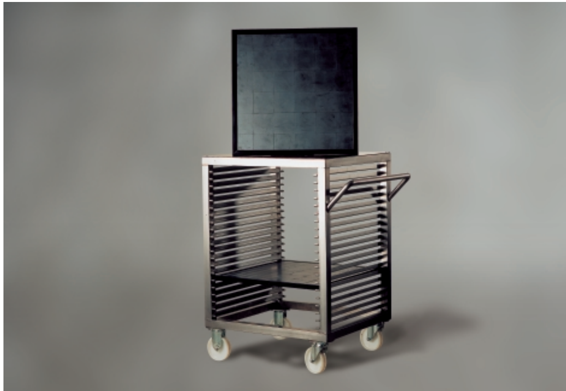
FP-2 ferrite tile floor plate and TP-21 trolley